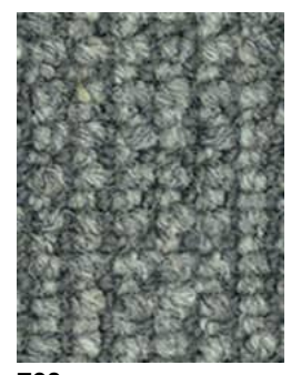
760 Grey Pebble