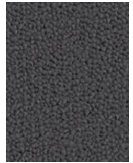
770 Mt Olympus