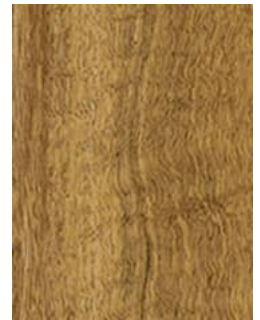
555 Grafton Spot.Gum