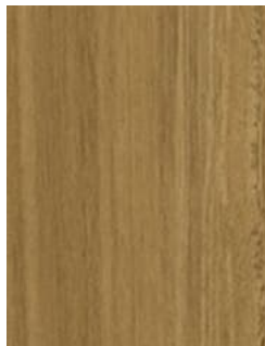
570 Western Blackbutt