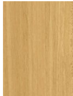
545 New Eng Blackbutt